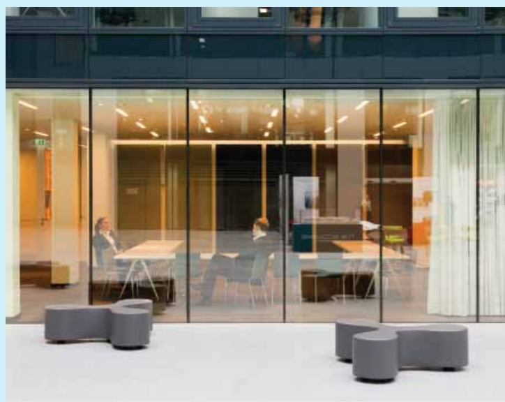
PRO TOUR/ALFT GMBH

The Squire, New Work City, Am Flughafen; thesquire-conference.com